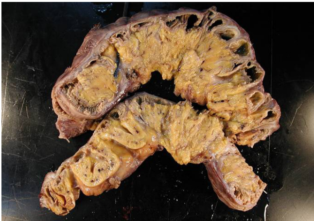
Figure 2. Fibrotic wall of perforated intestinal segment which resected